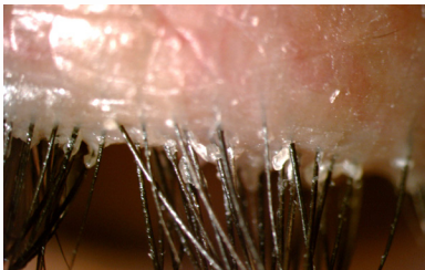
Before BlephEx ® MBE Treatment